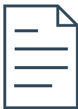
CompMS ADMINISTRATOR LIST