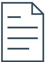
OUTCOMES & COMPETENCIES LIST