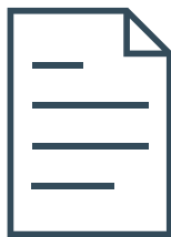
CompMS ADMINISTRATOR LIST