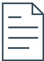
STAKEHOLDER REGISTRY & ROLES