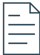
BLUEPRINT IMPLEMENTATION QUESTIONNAIRE