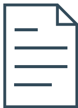
STAKEHOLDER REGISTRY & ROLES